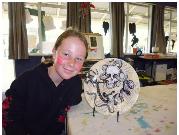
Georgia Room 3 and her gothic decoupage plate