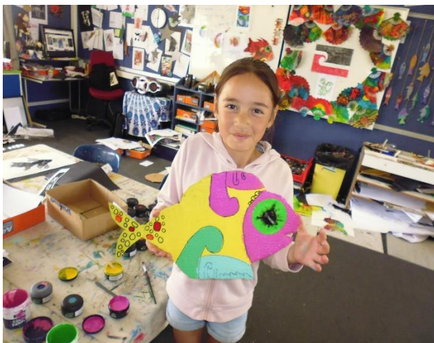
Czkarne Room 17 and her magic fish